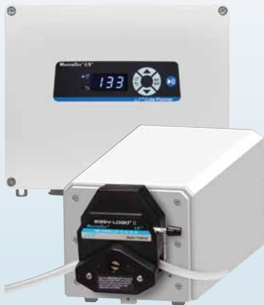
B L/S® Modular drive 07557-60 shown with Easy-Load® II pump head 77200-62