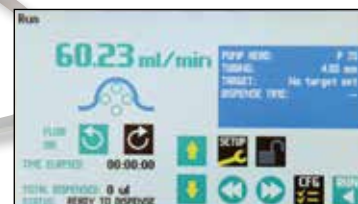
"Run" screen displays all operational parameters so you can confirm activity and program settings at a glance.