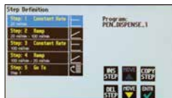
Set up single- or multi-step programs using the intuitive touch screen.

Quickly set up single- or multiple-step programs depending on the requirements of your application. The controller will store up to 50 programs with up to 20 steps each; programs are easily recalled for later use. When pumps are daisy-chained, programs can be transferred from pump to pump to ensure process or experimental consistency.